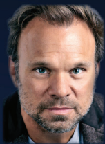
Norbert Leo Butz